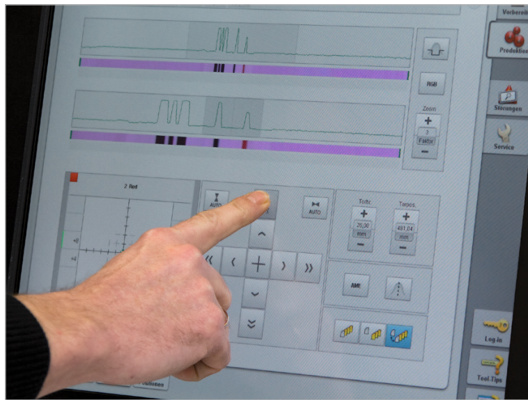
User interface with live image of the register marks

Appropriate outputs and connections for field buses are available for external capture of process data, such as register deviation.