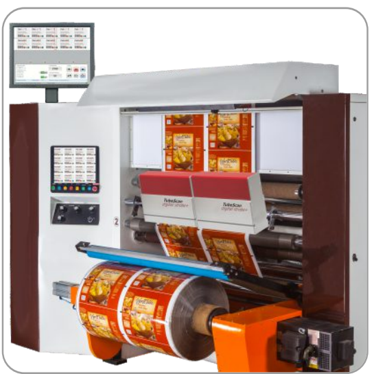
TubeScan on Doctoring Machine